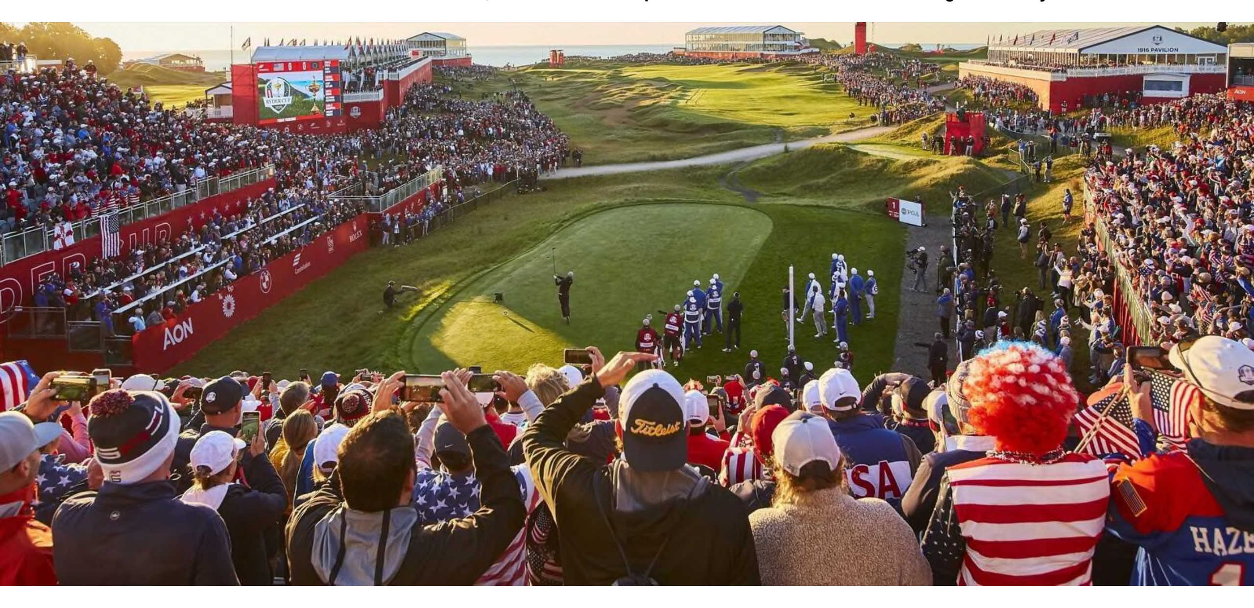
"We wanted to showcase to the world that this is a new generation for United States golf." - Bryson DeChambeau